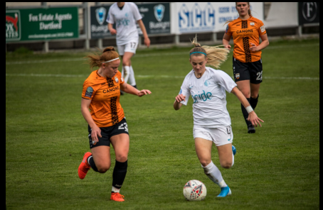
LONDON CITY LIONESSES VS LONDON BEES - OCT 20

With that in mind, today's game is an important chance for us to keep up at the right end of the table and make sure we capitalise on the strong position we've found ourselves at, six games into the season.