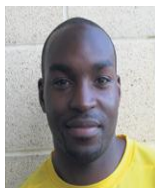
Ryman South Dulwich Hamlet