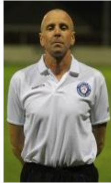
Lowestoft Town Leiston Folkestone Invicta