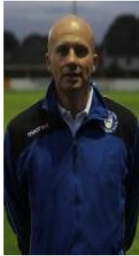
Ryman Premier Ryman North Ryman South