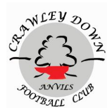
Ryman South Crawley Down